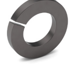
HELICAL SPRING LOCK WASHER - LIGHT