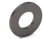
SAE FLAT WASHER STANDARD