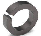
HI COLLAR SPRING LOCK WASHER