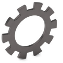
EXTERNAL TOOTH WASHER