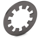
INTERNAL TOOTH WASHER