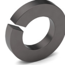
HELICAL SPRING LOCK WASHER - HEAVY