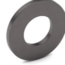
PLOW WASHER HARDENED