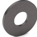
USS FLAT WASHER HARDENED